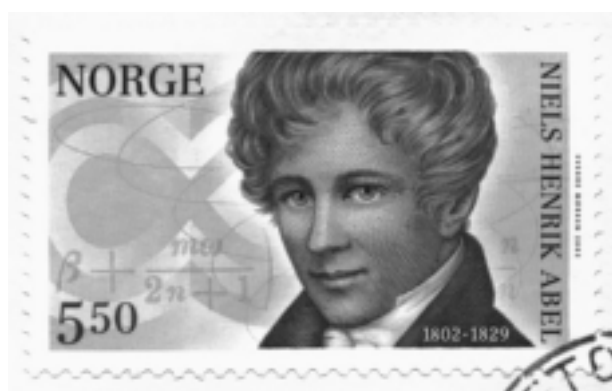
The new Norwegian stamp featuring Abel